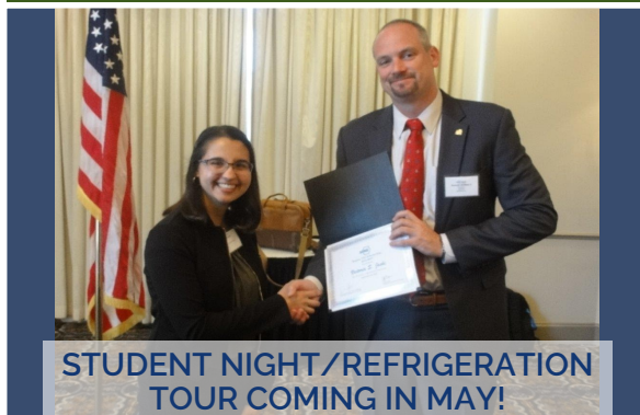
STUDENT NIGHT/REFRIGERATION TOUR COMING IN MAY!