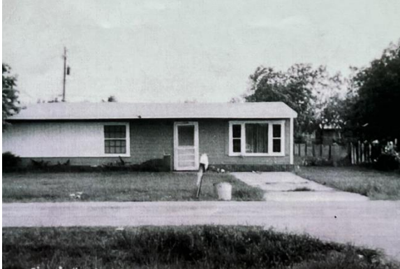
5805 Schumacher Residence

He opened Roessler Equipment in December, 1962, working out of his home as the representative for the McQuay product line. In 1966 he purchased the residence at 5805 Schumacher Lane Houston, Texas and renovated it to become the offices of Roessler Equipment Company, Inc.